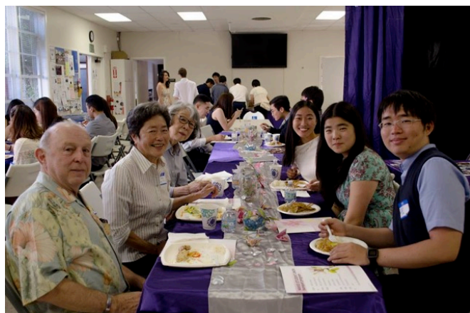
Berkeley JACL Board Members at NSU Year End Banquet

friends, or want to play sports, NSU offers a variety of options for them. Feel free to check out the club via the NSU Facebook page, or catch them tabling on Sproul Plaza during the semester.