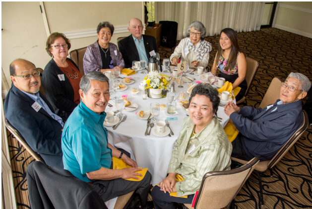
Berkeley JACL Attendees